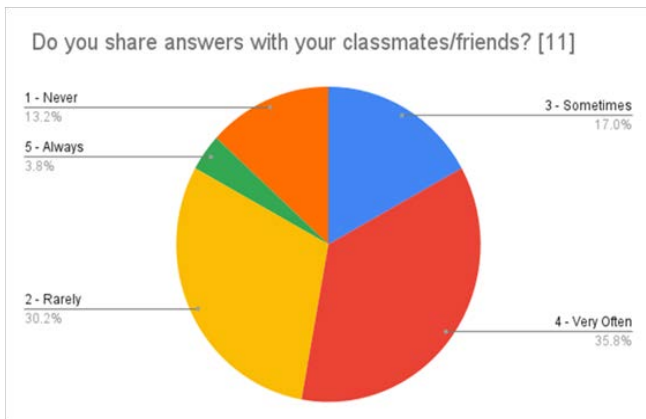
Figure 3. Degree of Sharing Answers in Written Exam/Assessment

Figure 3 shows that 3.8% share their answers with classmates/friends, 35.8% very often, 17% sometimes, 30.2% rarely, and only 13.2% never share their answers with others.