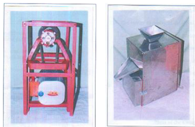
Figure 1: Right photo shows the Funnel and Metal Case Assembly made of stainless steel. Left shows the mounting of the Motor & Extrusion Assembly.

The construction of the machine has five (5) major parts as shown in Figure 1 namely: stand assembly, extrusion assembly, guide plate and cutter assembly, motor assembly and funnel case assembly.