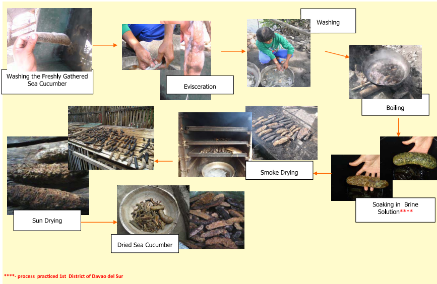
Figure 1. Drying process of sea cucumber in Davao del Sur.