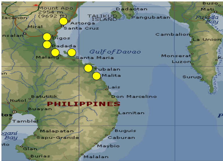
Figure1. Sites visited in Davao del Sur for data collection