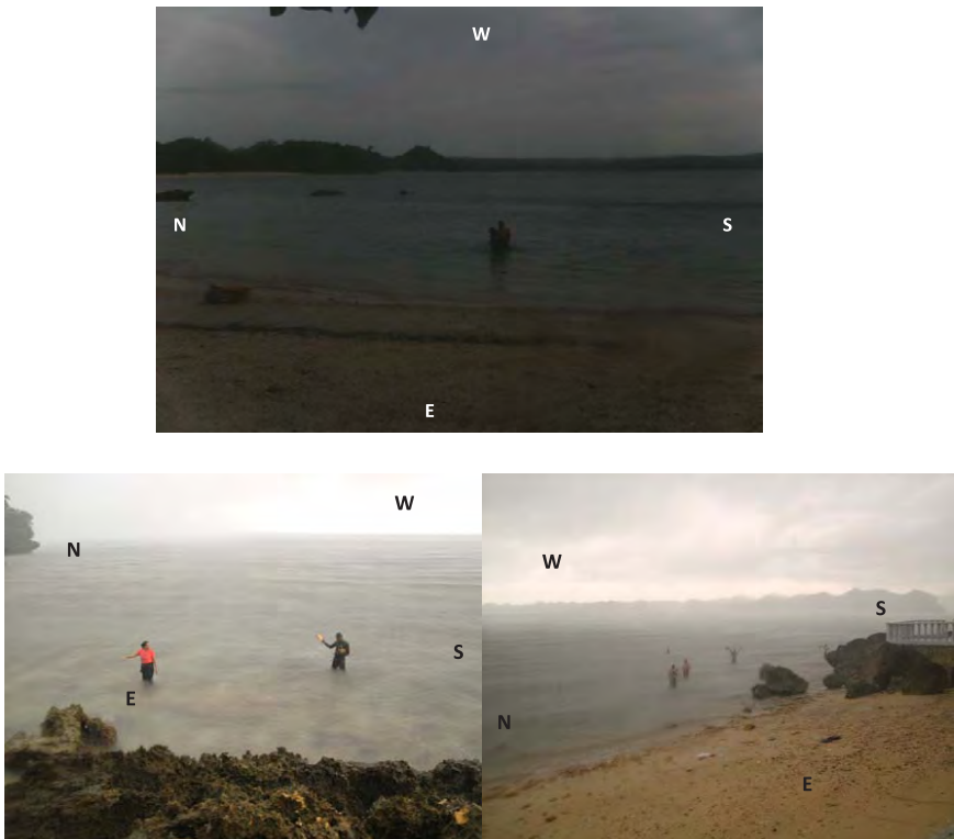
Figure 1. Igang Bay (A); Villa Corazon (B & C) sampling areas

The study sites were located at the Igang Bay and Villa Corazon, Villa Igang, Nueva Valencia, Guimaras. Igang Bay, with a total area of approximately 200 and 250 square meters, respectively (Figures 1A-C). Igang Bay is located at the front beach of Villa Igang Beach Resort bounded by land on northern, eastern and western sides and open on southern (Figure 1A) while Villa Corazon is located at the southeastern part of Villa Igang and bounded by land on northern side and open sea on eastern, southern and western sides (Figures 1B and C).