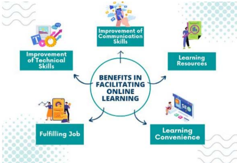
Figure 2. Benefits of TLE Teachers in Facilitating Online Learning

Connectivity. For both teachers and students, connectivity is a concern regarding assessment. There will be delays in retrieving instructions for assessment and submitting outputs if there is poor connectivity.